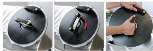
Blade removal tool pictured