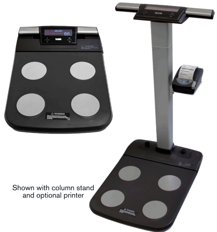
Shown with column stand and optional printer