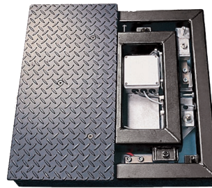
Cross section of the double frame with a ball mounted floating deck for impact protection.