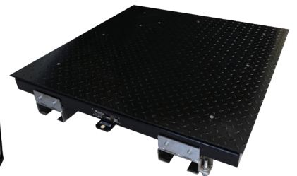
Optional forklift channels.