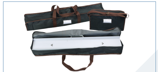
Image shows optional carry bags