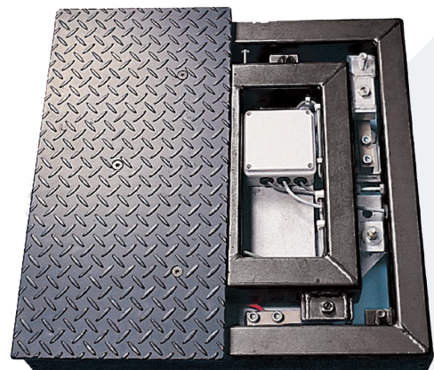
Cross section of the double frame with a ball mounted floating deck for impact protection.