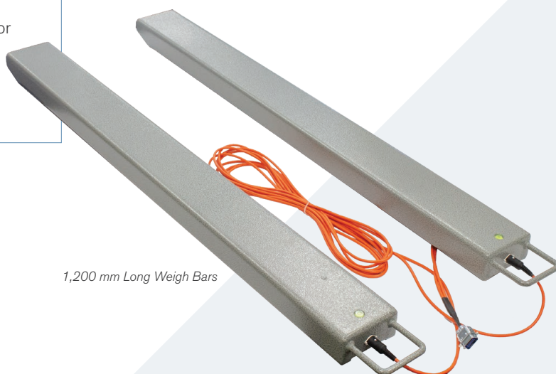
1,200 mm Long Weigh Bars