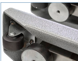
Wheels and Feet