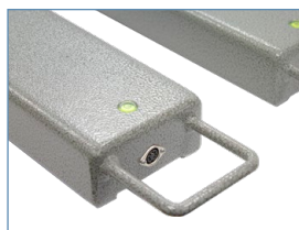
Carry Handles and Level Bubble