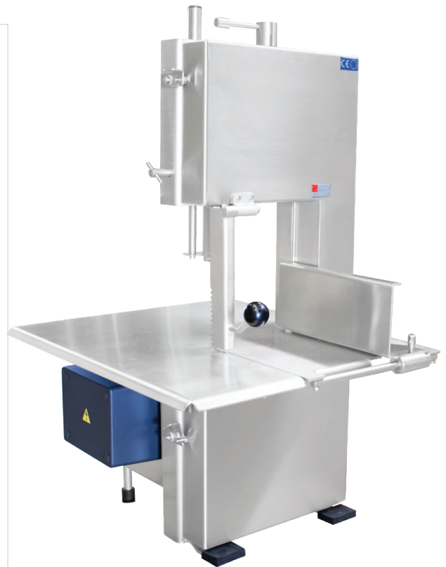
Image shows right hand table