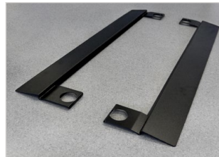
Optional expanding ramps