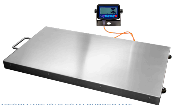
PLATFORM WITHOUT FOAM RUBBER MAT