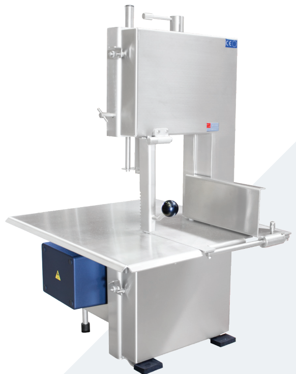
Image show right hand table