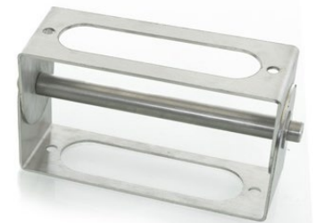
Optional Adjustable Wall Bracket (Part # GY3314)