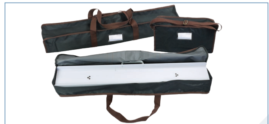
Image shows optional carry bags