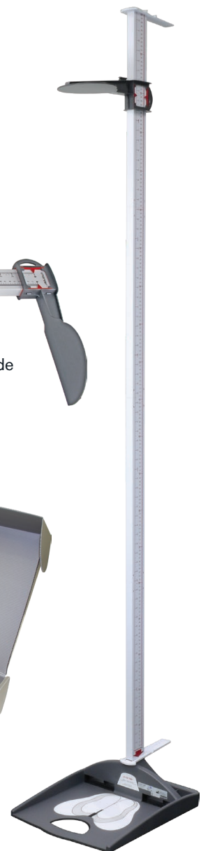
Vertical measurement mode (patient standing)

Specifications may change without notice